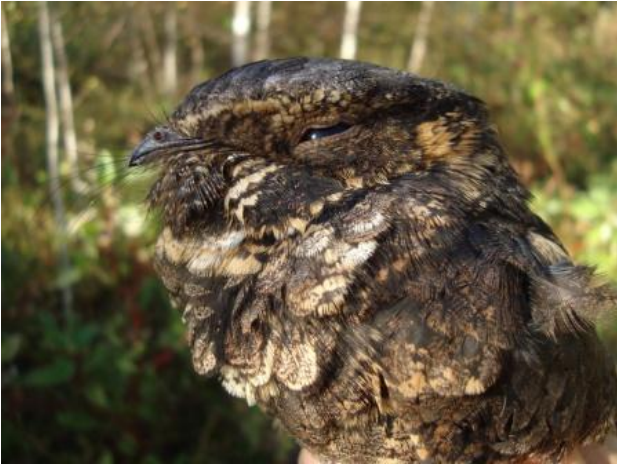
Whip-poor-will (B. Tryon)

Red-shouldered Hawk – observed on August 26 (1 st TTPBRS record)