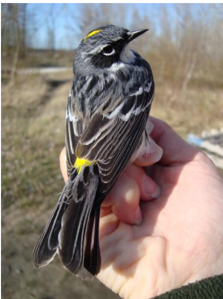
Myrtle Warbler (B. Tryon)

75 species were banded during spring 2010. A total of 1399 birds were banded in 3227 net hours for an average capture rate of 0.43 birds per net hour. The highest banding total was on May 10 when 114 birds were banded. The highest capture rate was on May 15 th , with a rate of 1.89 birds per net hour. The least productive day was April 23 with a total of 6 birds banded and 0.067 birds per net hour.