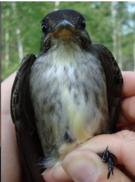
Olive-sided Flycatcher (B. Tryon)

Northern Shrike banded on April 4 – the second banding record Yellow Palm Warbler banded on April 5 – the third banding record Olive-sided Flycatcher banded on June 5 – the first banding record Pine Warbler observed on April 22, 23 and 30 Redhead observed on April 3 Ring-necked Duck observed April 1-3 Whimbrel observed May 23,24 White-winged Scoter observed on April 5,6 Yellow-throated Vireo observed on May 18,20