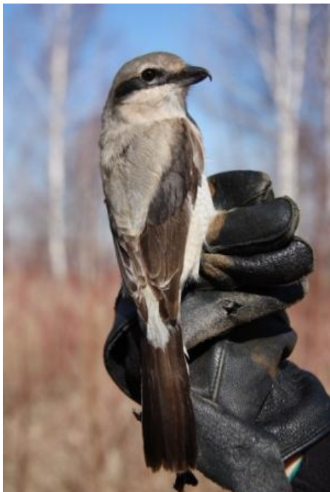
Northern Shrike (J. Zuloaga)