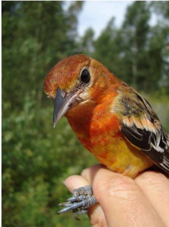
Baltimore Oriole