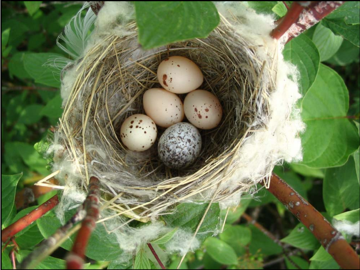
Willow Flycatcher nest- Tommy Thompson Park, summer 2005